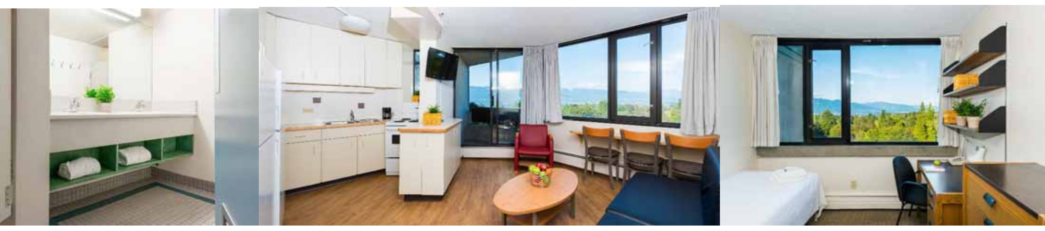
If capacity in the apartments and semi-private units are exceeded, students will be placed in traditional student dormitories