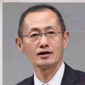
Shinya Yamanaka Kyoto University, Japan [2012 Nobel Laureates in Physiology or Medicine]