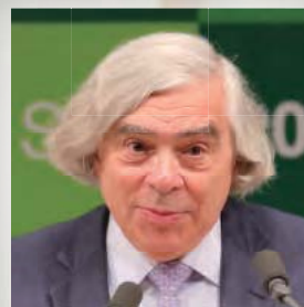
Ernest J. Moniz Massachusetts Institute of Technology (MIT), USA