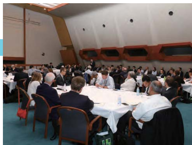
Concurrent Session: Artificial Intelligence (AI)