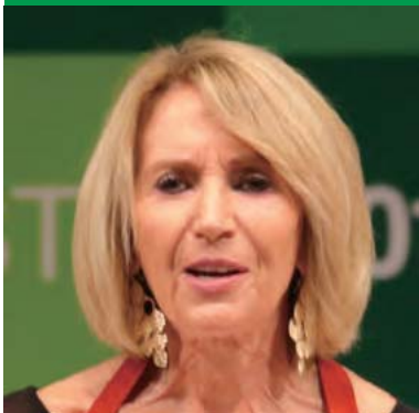
Marcia McNutt President National Academy of Sciences USA