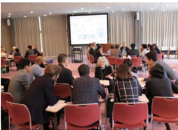
"Dialogue between Future Leaders and Nobel Laureates": Prof. Dr. Ada E. Yonath of Weizmann Institute of Science, Israel [2009 Nobel Laureate in Chemistry]

The sessions also offer opportunities to build networks across borders and disciplines, bringing together leaders from around the globe who share a common recognition of the issues we face.