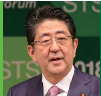
Shinzo Abe Prime Minister Government of Japan JAPAN