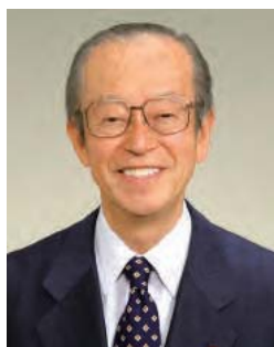
Koji Omi Founder and Chairman STS forum

STS forum , Science and Technology in Society forum , was founded in 2004 by Koji Omi, a former Minister of Finance and former Minister of State for Science and Technology Policy and for Okinawa and Northern Territories Affairs in the Japanese government. STS forum aims to provide a new mechanism for open discussions on an informal basis and to build a human network that would, in time, resolve the new challenges stemming from the application of science and technology. STS forum community also explores opportunities arising from science and technology and addresses how to remove barriers by using science and technology to solve the problems facing humankind.