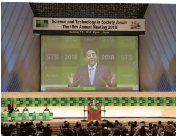
Prime Minister Shinzo Abe of Japan gives a keynote speech at the Opening Plenary.