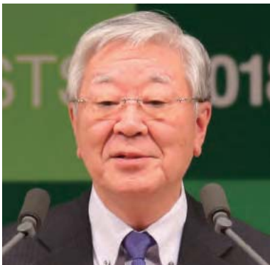
Hiroaki Nakanishi Chairman Keidanren (Japan Business Federation) JAPAN