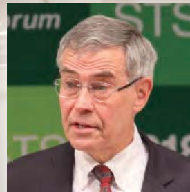
Rush D. Holt, Jr. American Association for the Advancement of Science (AAAS), USA