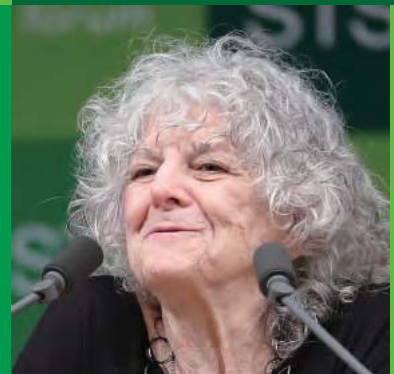
Ada E. Yonath Professor Weizmann Institute of Science ISRAEL [2009 Nobel laureate in Chemistry]