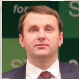
Maxim Oreshkin Ministry of Economic Development of the Russian Federation, Russia