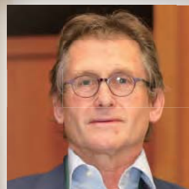
Bernard Feringa University of Groningen, Netherlands [2016 Nobel Laureates in Chemistry]