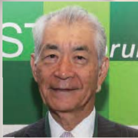
Tasuku Honjo Kyoto University, Japan [2018 Nobel Laureates in Physiology or Medicine]